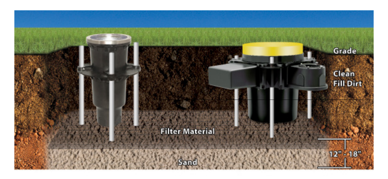
Detail B (Advanced Type II Installation)

These connecting trenches should be backfilled with compacted sand. Water will migrate through the sand to the lower elevations naturally via gravity (see Detail B).